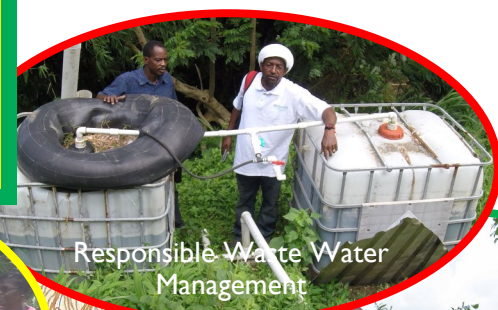
Responsible Waste Water Management