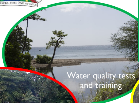
Water quality tests and training