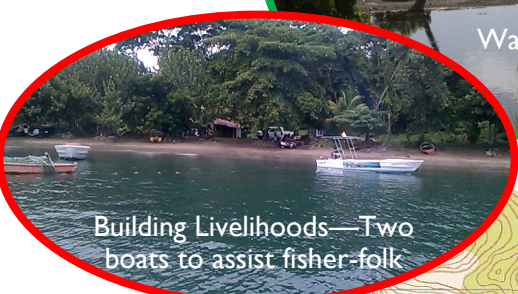
Building Livelihoods—Two boats to assist fisher-folk