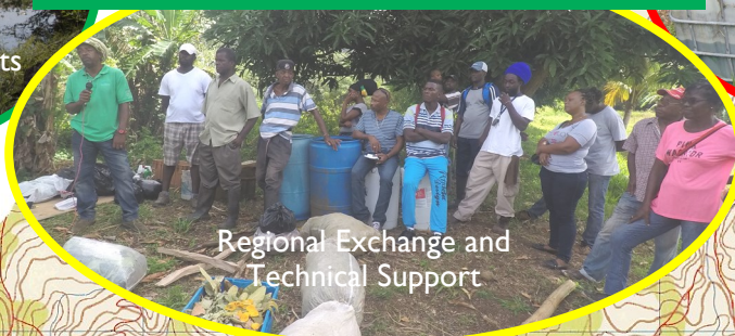
Regional Exchange and Technical Support