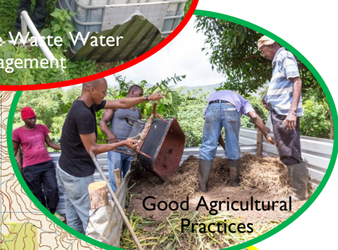
Good Agricultural Practices