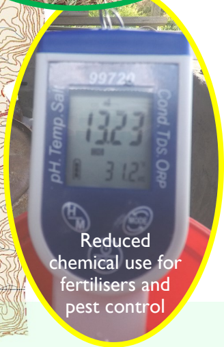
Reduced chemical use for fertilisers and pest control