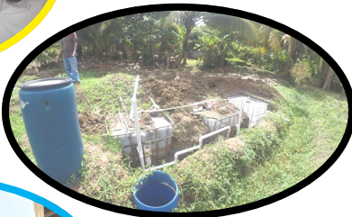
Biogas digester Installation