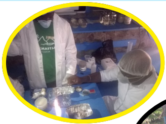
Mushroom Cultivation Training