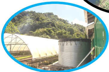
Water tank procurement