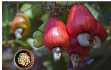
Assessment of potentials in the cashew Value chains in the Caribbean